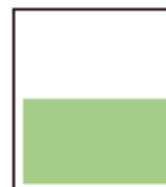
1/2 Horizontal 7.25" x 5"