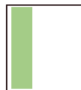
1/3 Vertical 2.25" x 10"