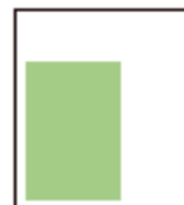
1/2 Vertical 4.75" x 7.5"