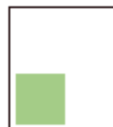
1/3 Horizontal 4.75" x 5"